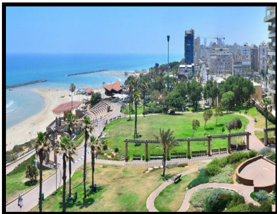
Great Views of the Mediterranean Sea

The free spa includes access to the indoor heated pool, Hammam, sauna and fitness area. Beauty treatments and access to the hot tub are available on request.