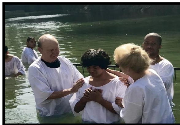
Baptism in the River Jordan