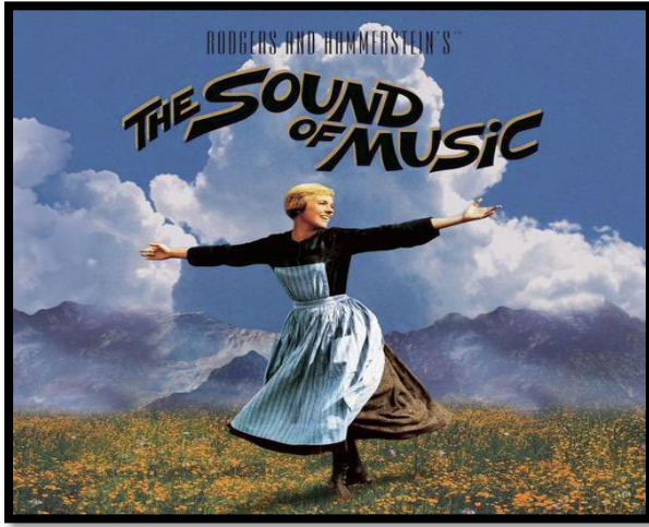
Lots of singing on the tour bus