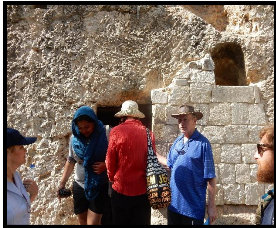
Enter the Tomb at the Garden