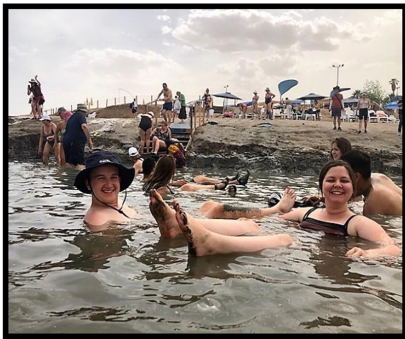
Enjoying floating in the Dead Sea