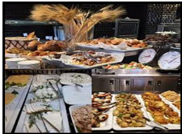
Delicious breakfast and dinner buffets

Address: King David St 8, Netanya, 4211503, Israel