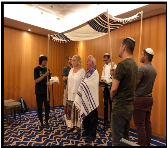
Renew your wedding Vows in Jerusalem