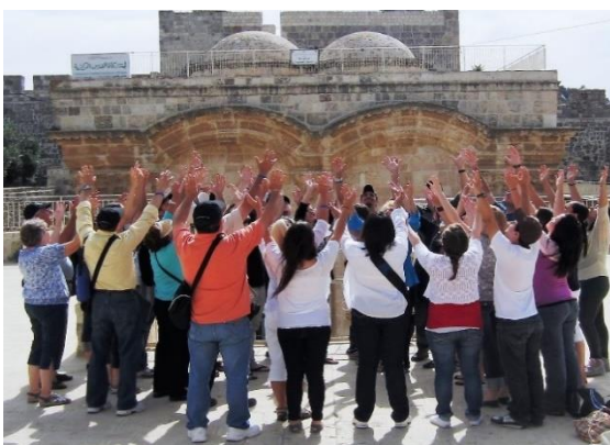
Looking up to heaven at the Eastern Gate