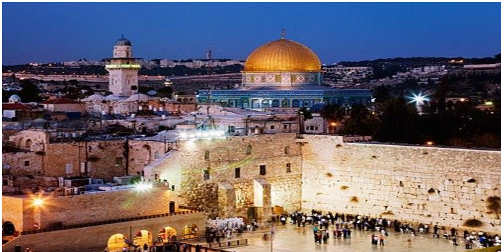
The Western Wall