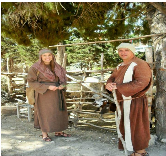
Visit Nazareth Village