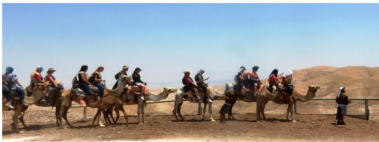
Ride camels to Father Abraham's Tent