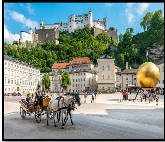
Old City of Salzburg

Horse drawn carriage ride in the Old City